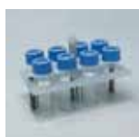
8 X 4 ml vials