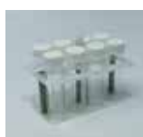
8 X 8 ml vials