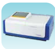
UV/VIS Spectro 2080+ Double Beam

Analytical Technologies is synonymous for offering technologies for doing analysis and is the Fastest Growing Global Brand having presence in at least 96 countries across the global. Analytical Technologies Limited is an ISO:9001 Certified Company engaged in Designing, Manufacturing, Marketing & providing Services for the Analytical, Chromatography, Spectroscopy, Bio Technology, Bio Medical, Clinical Diagnostics, Material Science & General Laboratory Instrumentation. Analytical Technologies, India has across the Country operations with at least 4 Regional Offices, 6 Branch Offices & Service Centers. Distributors & Channel partners worldwide.